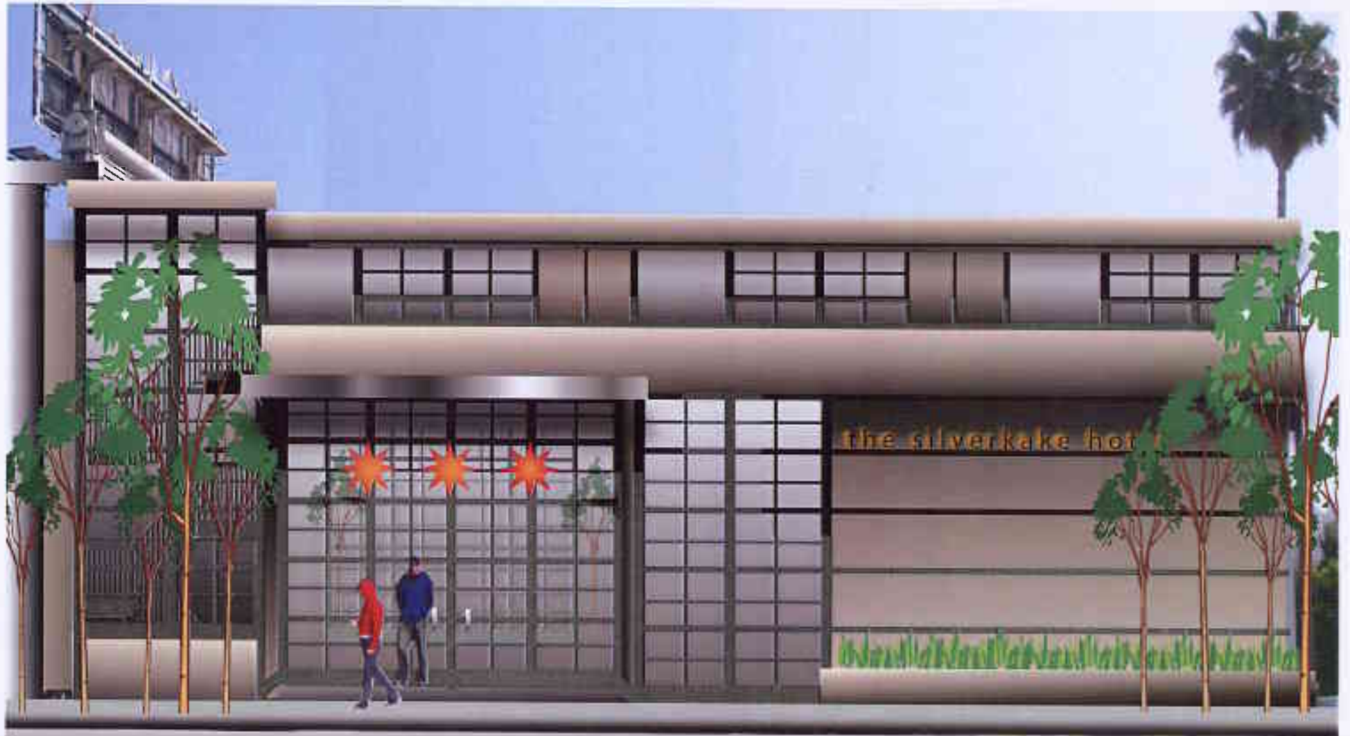
The Silver Lake Hotel Hotel Front /North East Sunset Boulevard