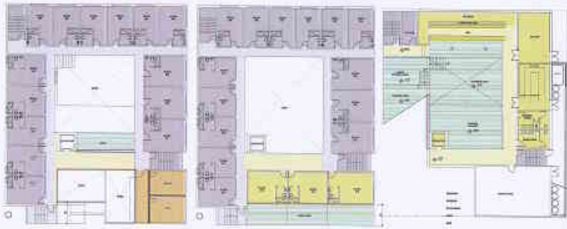
SECOND LEVEL FLOOR PLANS