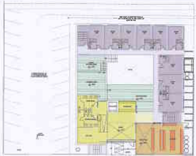
FIRST LEVEL FLOOR PLANS