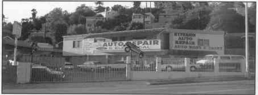
Even when it is not open the shop at Hyperion and DeLongpre offers up visual pollution. At least 15 vehicles were packed onto the property...not counting the one on the sign.

The neighborhood can be a little happier after the ruling, but the fight is not over. Many of the shops' activities can continue, so there is far more work to be done and battles to be fought along Hyperion before we can all breathe easier.