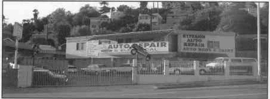
Even when it is not open the shop at Hyperion and DeLongpre offers up visual pollution. At least 15 vehicles were packed onto the property...not counting the one on the sign.

The neighborhood can be a little happier after the ruling, but the fight is not over. Many of the shops' activities can continue, so there is far more work to be done and battles to be fought along Hyperion before we can all breathe easier.